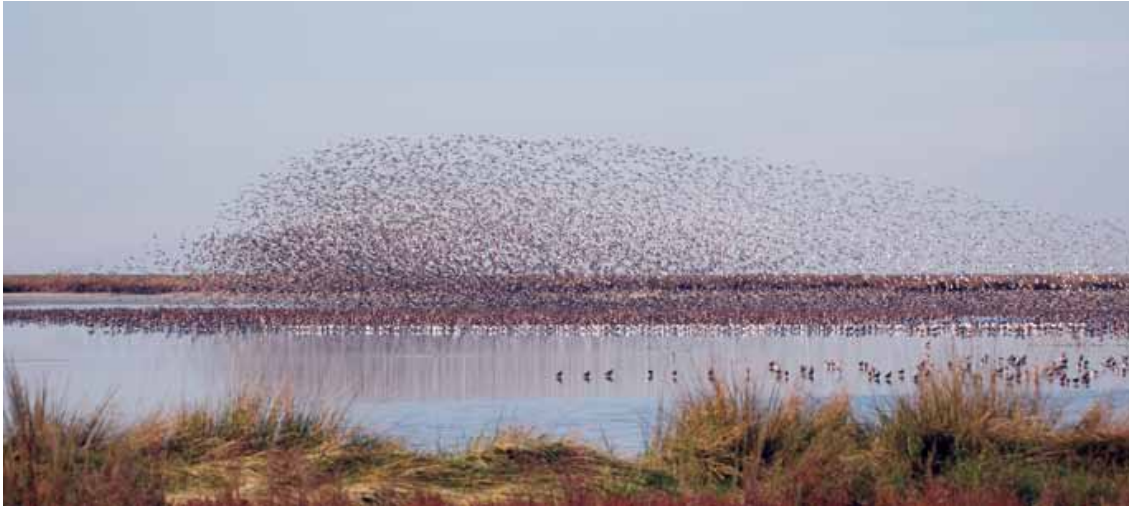
Fig. 2. A large flock of Black-tailed Godwits at Veta La Palma fish farm, Doñana Natural Park, SW Spain, in November 2010.

Could Doñana, SW Spain, be an important wintering area for continental Black-tailed Godwits Limosa limosa limosa ?